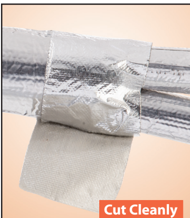
Cut Cleanly Scissors