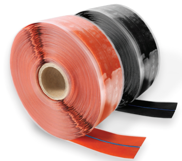
Colored guide line only on triangular type tapes.