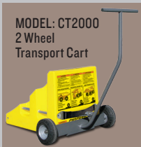
MODEL: CT2000 2 Wheel Transport Cart