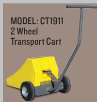
MODEL: CT1911 2 Wheel Transport Cart