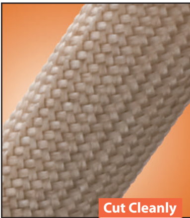
Cut Cleanly Scissors